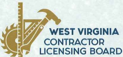
Chair, West Virginia Contractor Licensing Board

A copy of this license must be readily available for inspection by the Board on every job site where contracting work is being performed. This license number must appear in all advertisements, on all bid submissions, and on all fully executed and binding contracts. This license is non-transferable. This license is being issued under the provisions of West Virginia Code, Chapter 30, Article 42.